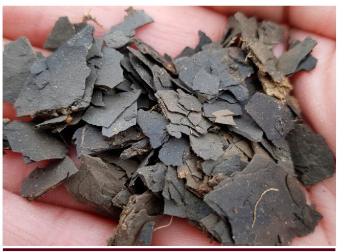
Figure 1 Plates of natural alginite

Alginite has the characteristic of organic soil. Organic substances significantly increase humidity and plasticity. The humidity determined by drying at