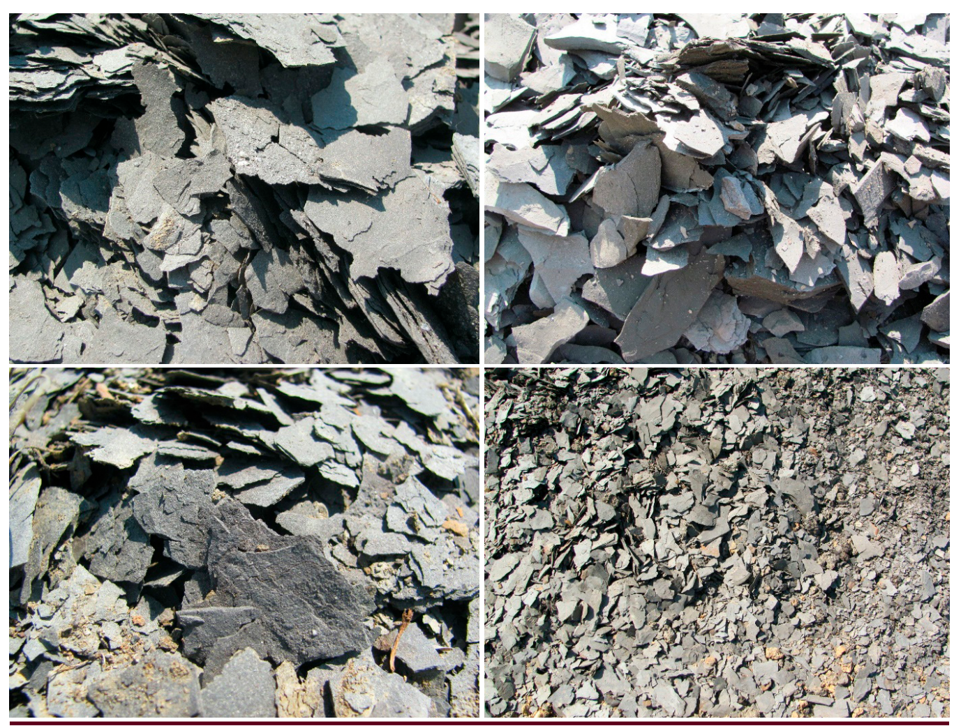
Figure 2 Natural alginite in the Pinciná deposit, Slovakia

22–30 °C was in the range of 57.75–78.63 %. Samples from the top layer of the alginite showed 15 % higher humidity when dried at 60 °C than when open-air drying. When dried at 105 °C temperature, the humidity was