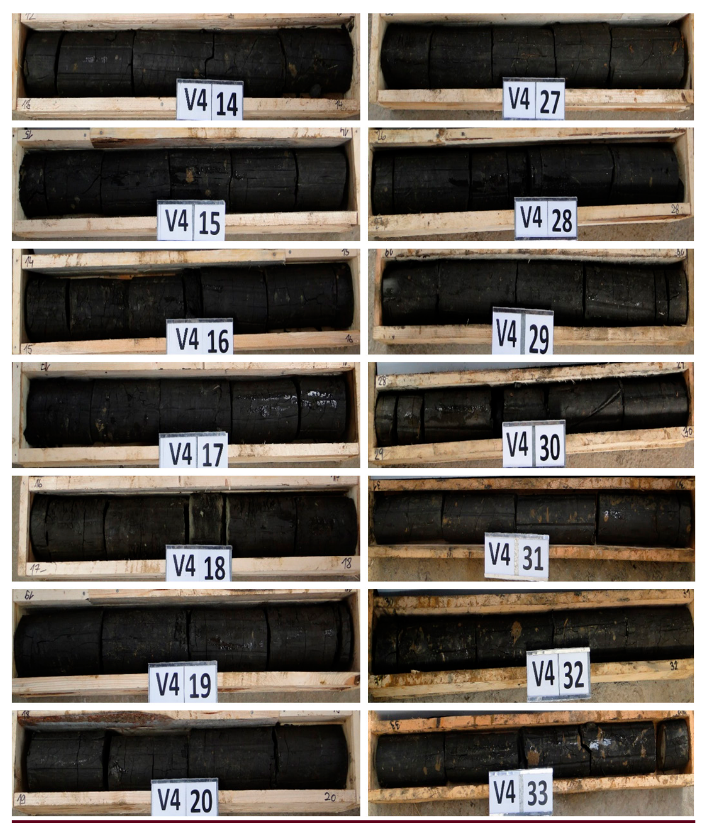
Figure 3 Colour of wet alginite samples obtained from different depths at the Pinciná deposit