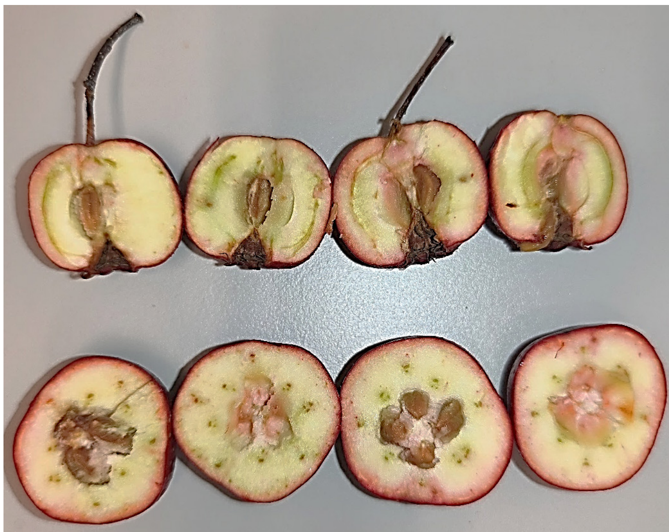
Figure 2 Comparison of selected fruits n of Crataegus pinnatifida Bge. var. major N. E. Brown in longitudinal and cross-sectional views

The seeds are elongated to ovate, with a smooth surface and brown to dark-brown coloration. Variability in seed length, width, and shape index (Figure 3) indicates a considerable degree of intraspecific morphological diversity.