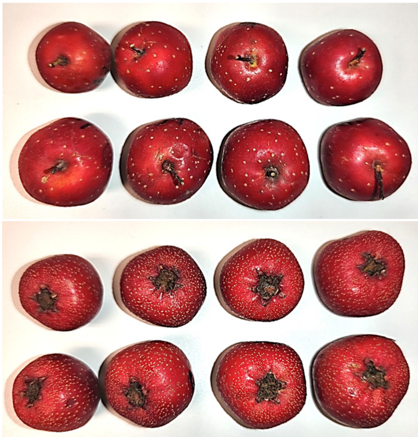
Figure 1B Morphological variability of fruits of Crataegus pinnatifida var. major : Variation in the depth of the stalk cavity and eye basin