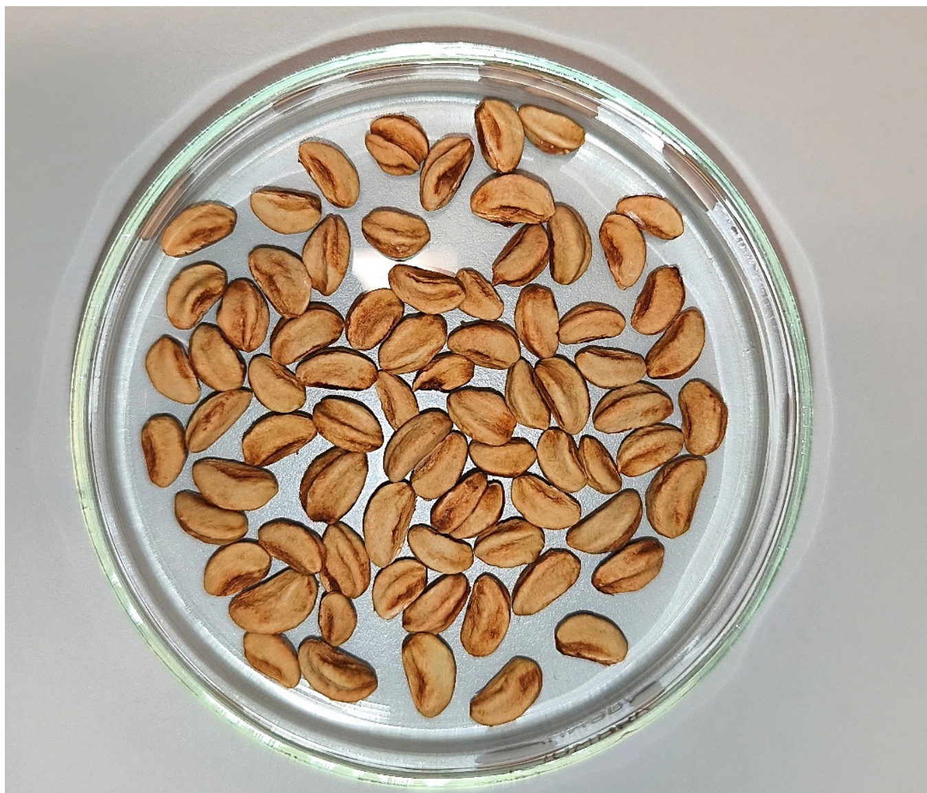
Figure 3 Variation in seed shape and colour of selected samples of Crataegus pinnatifida Bge. var. major N. E. Brown